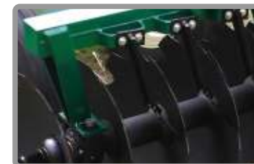
Limpiadiscos tipo pala, reforzados con soportes individuales.