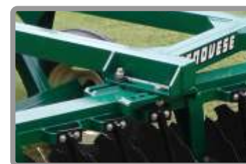
Correderas mixtas que evitan desplazamiento por desajuste.